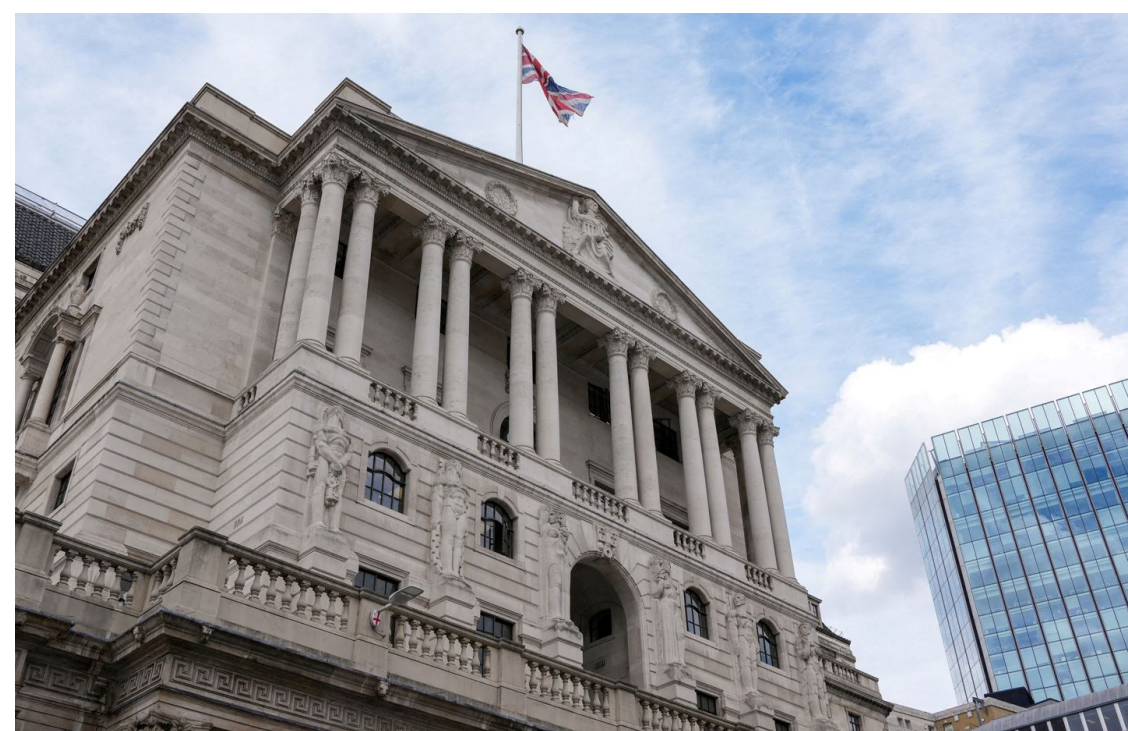
The BoE's decision to raise rates coincided with a 0.75% increase by the US Fed